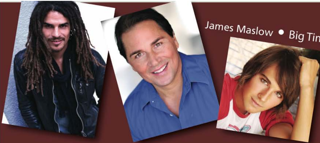
James Maslow • Big Time Rush